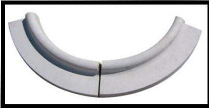
True Serrail - 36" c. 12"