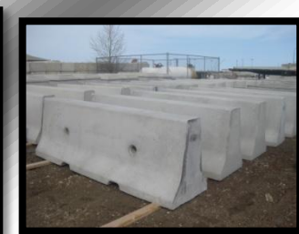
New Jersey Turnpike II