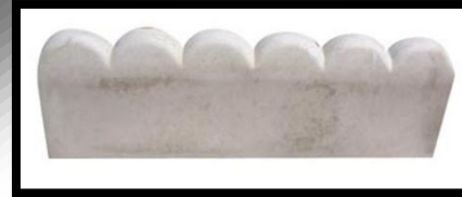
Scalloped Edge 8" c. 0" x 2" Long