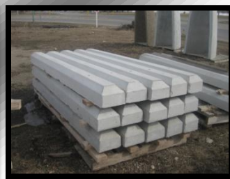
5 c. 6" Parking Curb