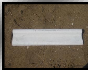
36" Straight Edge