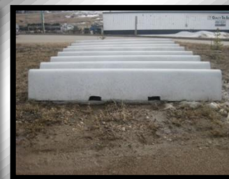
New Jersey Turnpike